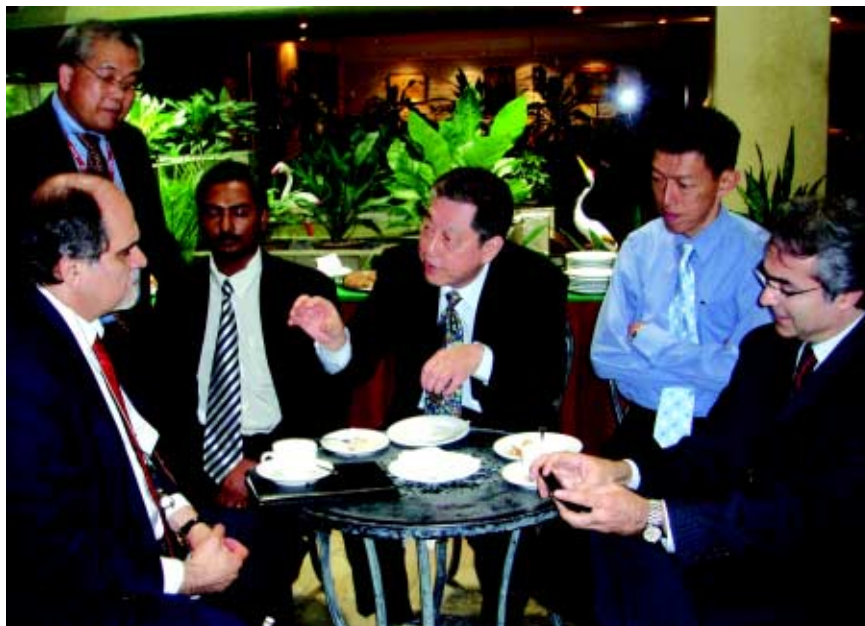
Officials of MIC, HELP University and AIBD discuss their joint undertaking to offer a new MBA programme on Media and Communication