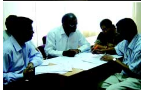
The Senior Managers in programme, production, engineering, finance, ICT, HRD brainstorming the training needs of MBC