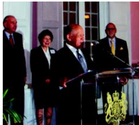
H.E. The Hon Arthur Hanna, Governor-General, Nassau Bahamas, speaking at the CBA Conference

SBS (Australia) won the CBA-Amnesty International Award for Human Rights Programme for the television feature "Race for the Beach," a programme dealing with the struggle of a hijab-wearing Muslim girl and 20 other young Muslims to become surf life savers at Sydney's Cronulla beaches in the wake of the anti-Muslim race riots in Australia.