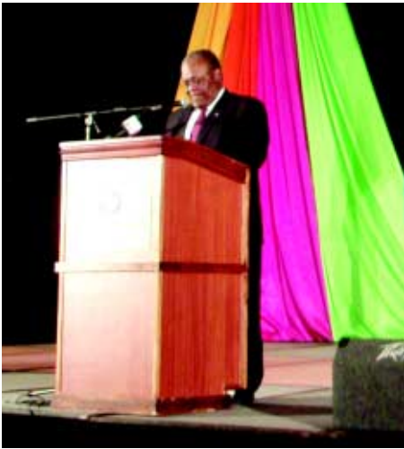
Prime Minister of Bahamas speaking at the inauguration ceremony of the CBA Conference in Bahamas

The 27th General Conference of the Commonwealth Broadcasting Association held in Nassau, Bahamas from 23- 26 January was a resounding success. Its theme was "Empowering the People." Some 200 delegates participated in the conference, including 40 CEOs, 13 Senior Engineers/Technical Directors, and 51 women broadcasters.