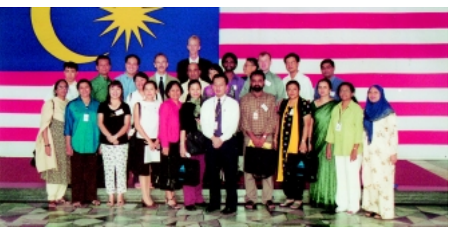
Visit to Radio Television Malaysia