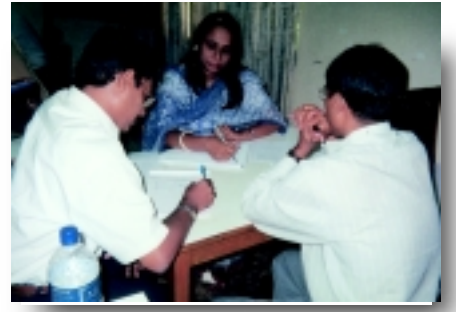
Working on group projects....

In pursuance of its mandate to assist the member organizations of electronic media in the Human Resources Development, AIBD organized the 10 days In-country workshop on ' Training of Trainers ' at Dhaka (Bangladesh). The workshop was organized in collaboration with the National Institute of Mass Communication (NIMC), Dhaka with the funding support from UNESCO. The workshop was designed to equip the participants with necessary knowledge